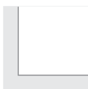
CONCEALED Z CLIP